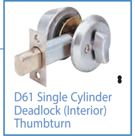
D61 Single Cylinder Deadlock (Interior) Thumbturn

Cylinder Options – Accepts 6 or 7 pin interchangeable cores. Supplied less cores. Will accept Best™ or Falcon™ type cores.