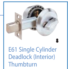
E61 Single Cylinder Deadlock (Interior) Thumbturn

Cylinder Options – Accepts 6 or 7 pin interchangeable cores. Supplied less cores. Will accept Best™ or Falcon™ type cores.